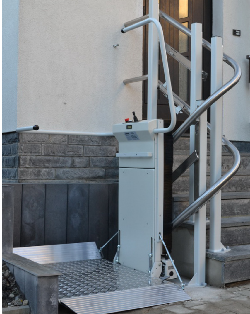
Robust design for outdoor installations

Fully automatic platform functions and ergonomic controls allow a simple and comfortable control of the platform.